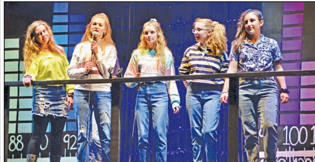
The UCHS Theatre Department put on three spectacular performances of "Back to the '80s" musical between Saturday, Nov. 16, and Monday, Nov. 18.